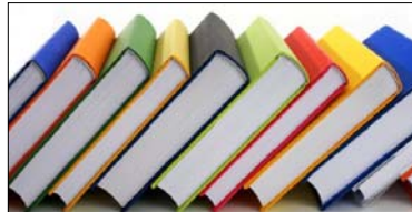
Friends of the Library Book Sale

Thursday, November 3: 12:30pm – 7:30pm Friday, November 4: 9:00am – 4:00pm Saturday, November 5: 9:00am – 4:00pm