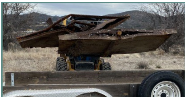
ADEQ and Dewey-Humboldt Historical Society (DHHS) work cooperatively to salvage historical items