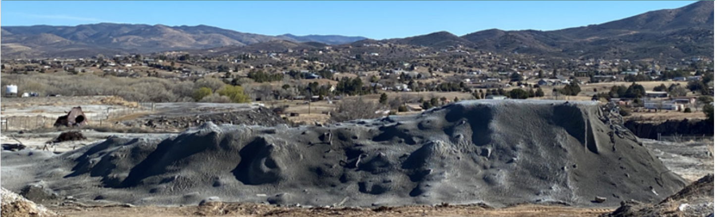
View of project area looking east, upon completion in March 2022