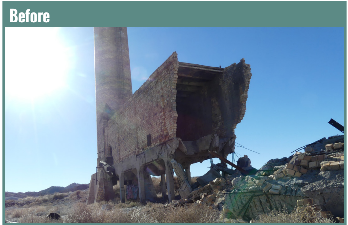
Before (January) and after (February) images showing encapsulated bricks